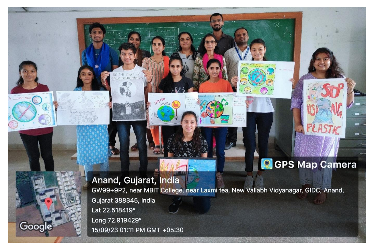
Figure 1 : Concluding the Competition