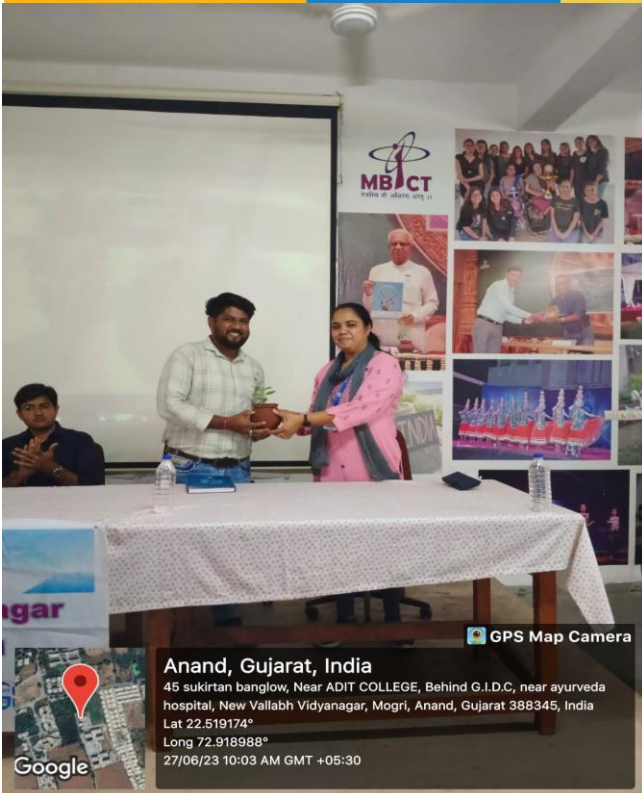
Anand, Gujarat, India 45 sukirtan banglow, Near ADIT COLLEGE, Behind G.I.D.C, near ayurveda hospital, New Vallabh Vidyanagar, Mogri, Anand, Gujarat 388345, India Lat 22.519174° Long 72.918988° 27/06/23 10:03 AM GMT +05:30

"Be a ray of hope for someone, be a donor, and save someone's life."