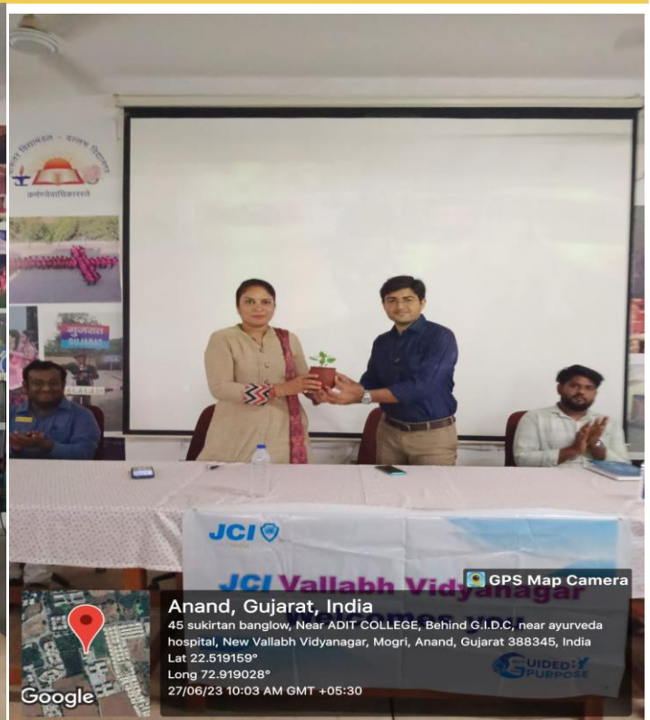
Anand, Gujarat, India 45 sukirtan banglow, Near ADIT COLLEGE, Behind G.I.D.C, near ayurveda hospital, New Vallabh Vidyanagar, Mogri, Anand, Gujarat 388345, India Lat 22.519159° Long 72.919028° 27/06/23 10:03 AM GMT +05:30