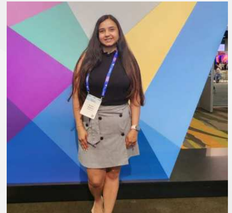
SOFTWARE ENGINEER, RUBRIK INC, CALIFORNIA