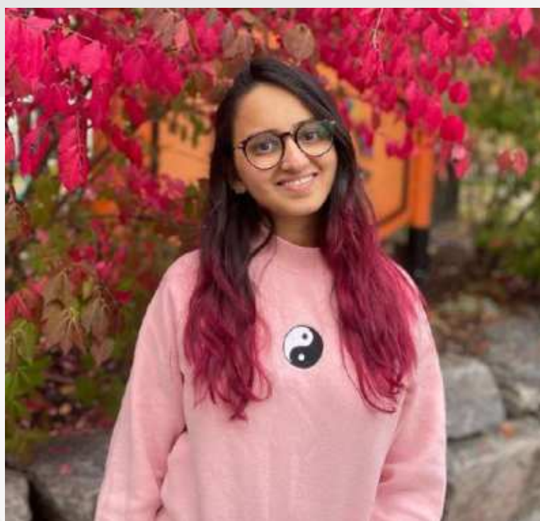
SALESFORCE ADMIN, TONAL, CANADA